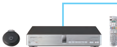
(KX-VC500 + Boundary Microphone)