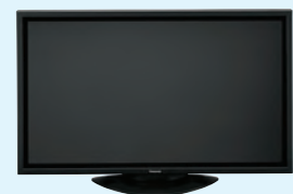
Full-HD Plasma Display