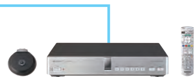
(KX-VC500 + Boundary Microphone)