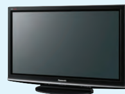
Full-HD Plasma TV