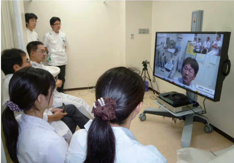
Yamagata University Faculty of Medicine members meeting with members of the Towada City Hospital.