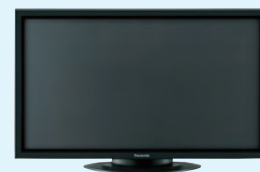
Full-HD Plasma Display