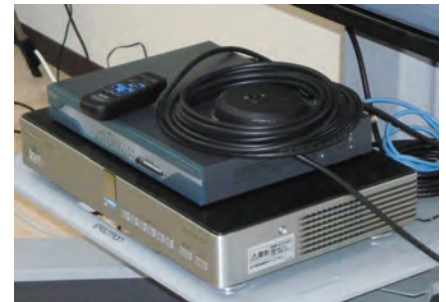
The HD Visual Communications Unit, Boundary Microphone, and Router.